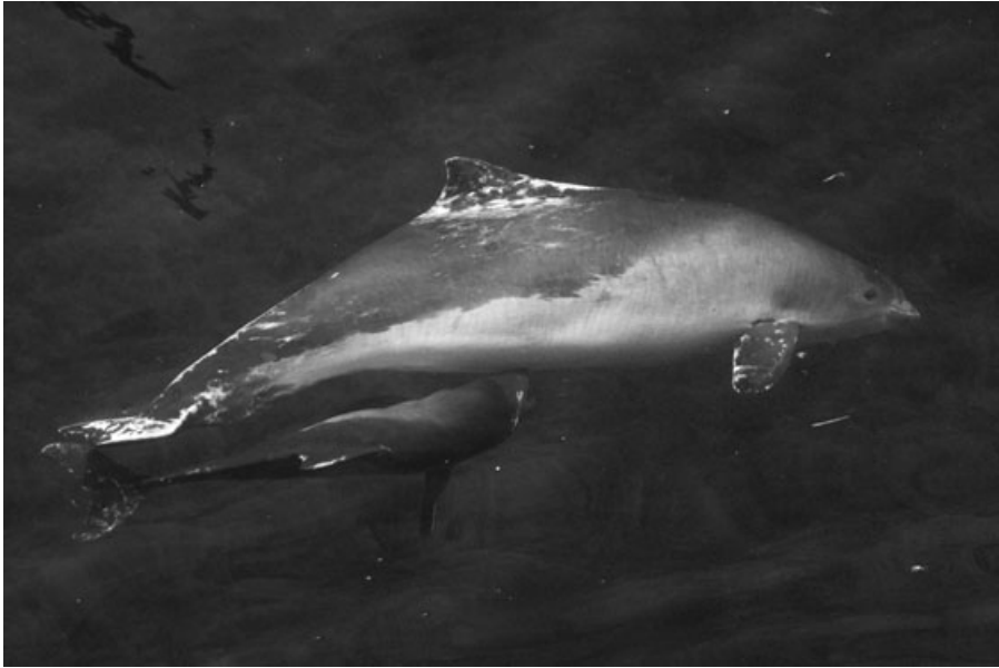
Figure 1. Porpoise calf suckling its mother by placing its mouth over the mammary slit.

1995), it is generally believed that cetacean offspring ingest milk through their oral cavity in a way similar to terrestrial mammals (Clutton-Brock 1991). Despite the unusual head anatomy of the sperm whale, observations by both 19th century whalers and more recent, brief observations by snorkelers, suggest that the calf dives subsurface and rolls under the adult female's underbelly to get the nipple in the gape of the its jaw (Beale 1839, Best et al. 1984, Gordon 1987) in the same way as other cetaceans (Fig. 1) (Drinnan and Sadleir 1981, Eastcott and Dickinson 1987, Russell et al. 1997).